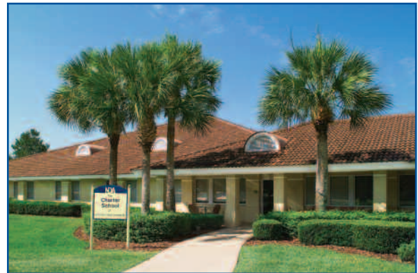
Entrance to the Charter School at National Deaf Academy