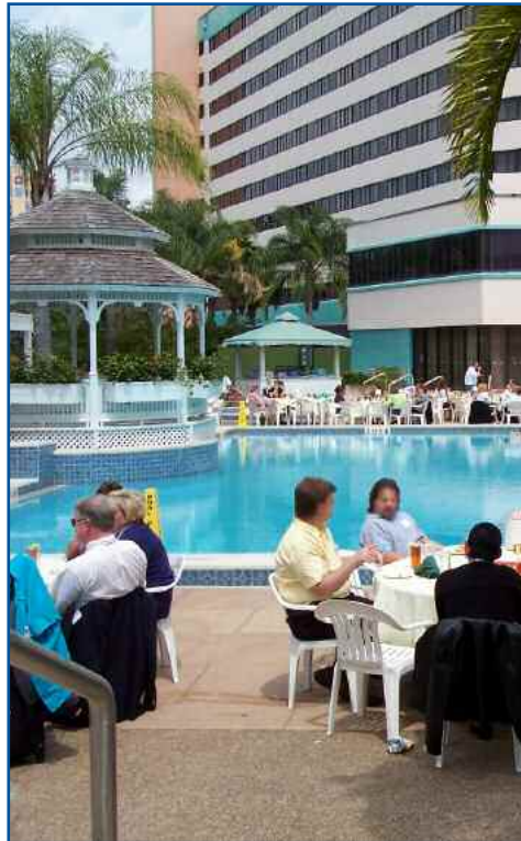
2004 International Conference Poolside Lunch at the Hilton at the Walt Disney World® Resort

The Conference, held at the Hilton at the Walt Disney World® Resort, was attended by more than 200 people. We were very proud to provide the participants with unique information and training from Deafness professionals from throughout the world. Speakers from France, England, Belgium, and Holland shared their clinical experiences from their work with Deaf patients in their respective countries. In addition, other speakers now living in the United States, originated from Malaysia, Taiwan and Nepal.